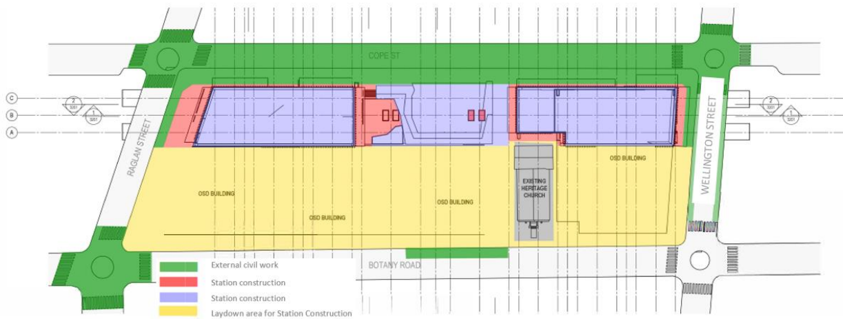
Figure 2: Waterloo ISD location and extent of work

The EIS (2016) included a detailed heritage impact assessment (HIA) for the known heritage items in the Waterloo study area as described in Figure 1. The findings are summarised in Table 6.