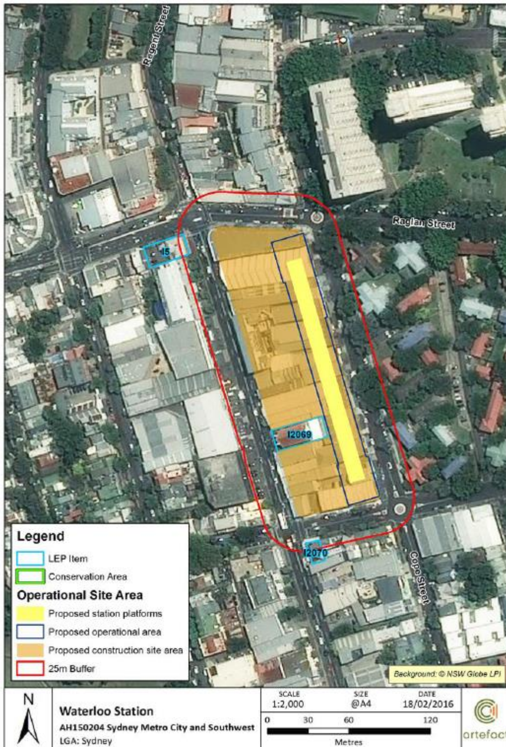
Figure 1: Location of heritage listed buildings

The existing environment and heritage context of the Waterloo ISD has been broadly assessed in the following Technical Reports included in the EIS