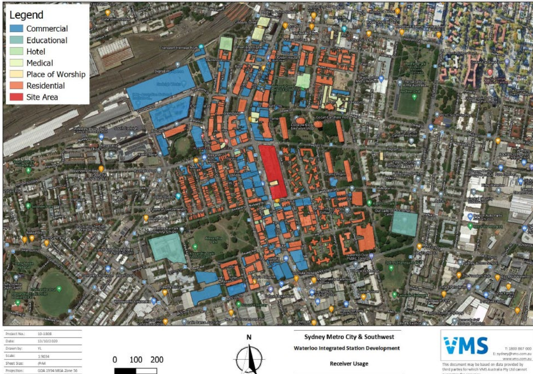
Figure 2 Noise Sensitive Receivers