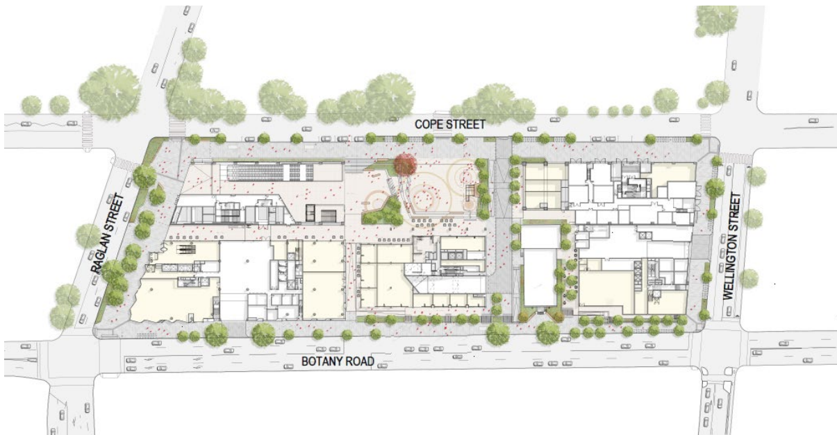
Figure 1 Location of the Waterloo ISD

The Waterloo ISD is located within Sydney’s suburb of Waterloo, as shown in Figure 1, within the Metro Quarter. The Metro Quarter Development (MQD) comprises the land bounded by Botany Road, Raglan Street, Cope Street and Wellington Street, but excluding the Congregational Church located at 103 Botany Road. It is situated approximately 3km from the Sydney CBD and is surrounded by established residential and commercial land uses. The MQD incorporates the Waterloo ISD and the Over-station Development (OSD) however, the OSD component is not subject to the CSSI Project Planning Approval (SSI15_7400) and therefore does not form part of the scope of this report.