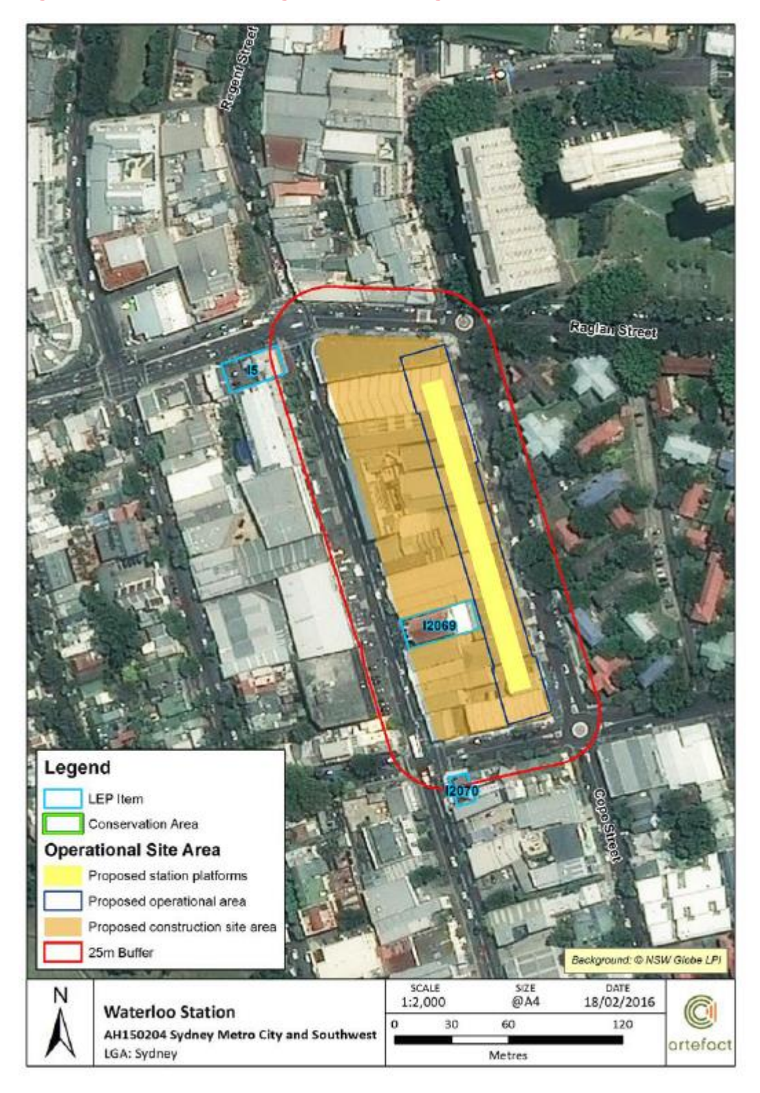
Figure 1: Location of heritage listed buildings

The existing environment and heritage context of the Waterloo ISD has been broadly assessed in the following Technical Reports included in the EIS